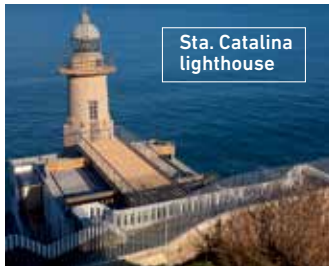
Sta. Catalina lighthouse

Another building worthy of a visit is Santa Catalina lighthouse , still in service and the headquarters of a Technology and Navigation Interpretation Centre. Open to the public at the weekend, it aims to keep the fishing tradition alive. This is the perfect place to watch the sun go down, as it is just twenty minutes walking from the Old Quarter. Other interesting walks include the climb to Mount Lumentza (approx. 15 minutes), from where it used to be possible to sight whales, and the Lea path.